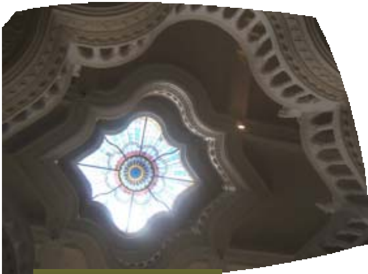
Museum of Applied Arts, Budapest

While the collection as a whole spans several centuries, there are a significant number of pieces in all areas that reflect the art nouveau style popular in the period when the museum was built. This is a museum about time: time spent in years of apprenticeship, time spent in importing gold, silver and precious stones, and time spent in the production of some of the highest quality artworks that material culture has to offer anywhere in the world. If you ever get the chance to visit Budapest, spend a little time yourself in this lovely museum.