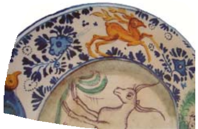
Museum of Applied Arts, Budapest

Although the textile collection itself is small, as an embroiderer and surface designer I constantly found inspiration in the decoration of objects all around me, from ceramics to furniture. I have pages of drawings that have direct application to my textile practice. Every single item in this museum is intricate in design and perfect in execution.