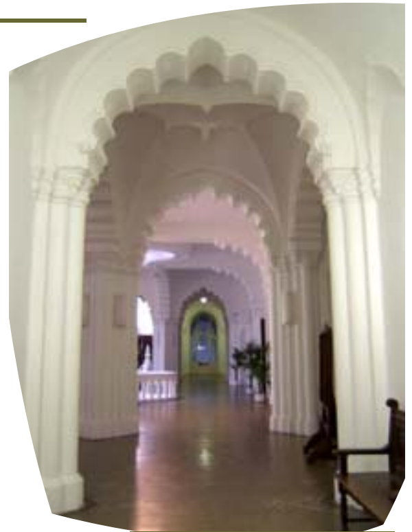
Museum of Applied Arts, Budapest

In the museum, stunning examples of art nouveau furniture sit beside magnificently painted watch cases illustrated with pictures that look as though they were painted with a one-haired brush, so fine is the detail. There is a small collection of the finest European lace, as well as some silk embroidered waistcoats from the 18 th century. There are beautifully bound books, silverware, glass, fabulously decorated keys of all sizes, ceramics, dishes, needlepoint chairs, etc. This summer they had an exhibition of Tiffany and Galle art nouveau glass that would take your breath away. There was also a