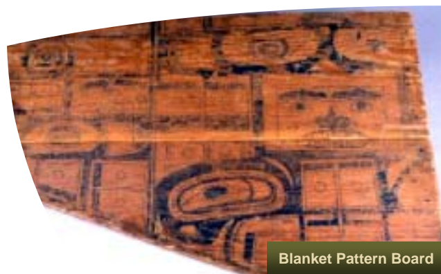
Blanket Pattern Board

St. James Presbyterian Church (west side, lower level) 910 - 14 th Street, Bellingham, WA